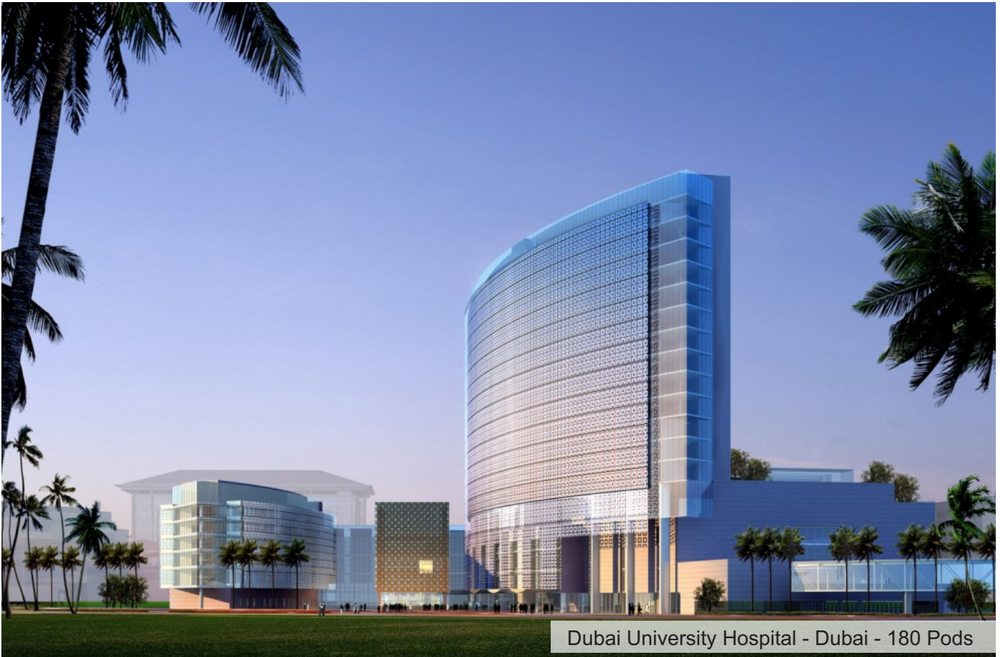
Dubai University Hospital - Dubai - 180 Pods