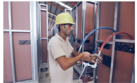
Electrical and Plumbing