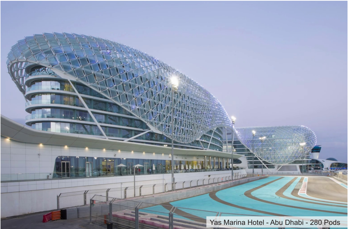
Yas Marina Hotel - Abu Dhabi - 280 Pods