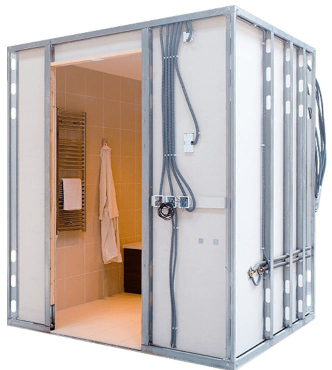
100% Finished Unit Ready for Delivery