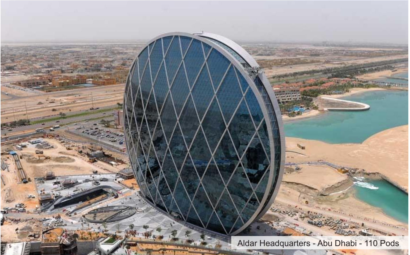
Aldar Headquarters - Abu Dhabi - 110 Pods