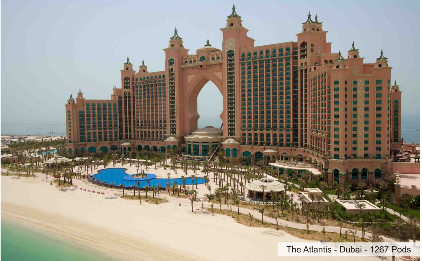
The Atlantis - Dubai - 1267 Pods